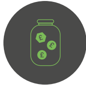
Pension Scheme Auto Enrollment