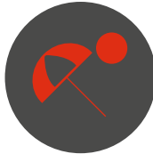
Great Annual Leave Allowance